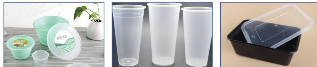
技术参数表/Technical parameter table